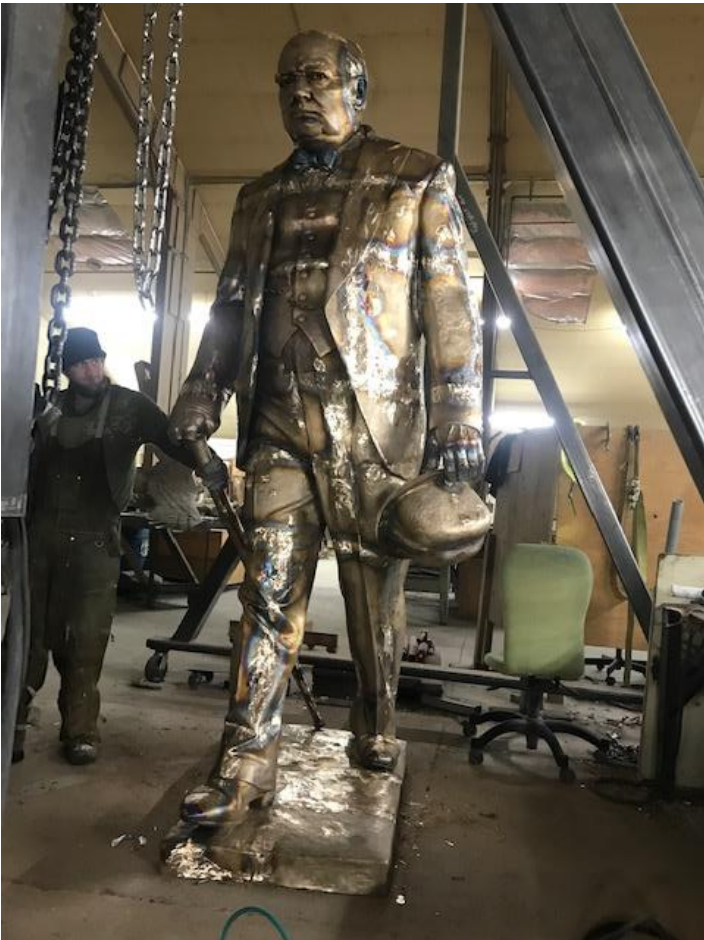
The Churchill statue being bronzed in Montana before returning to Alberta, November 2022

“I get my exercise serving as pall-bearer to my many friends who exercised all their lives”.