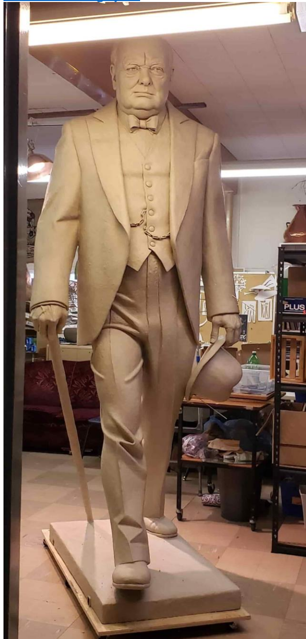
Another view of the statue, Edmonton, November 2021

To keep up to date on this, please refer to the Churchill Leadership Initiative and Statue Project page at www.churchillcalgary.ca .